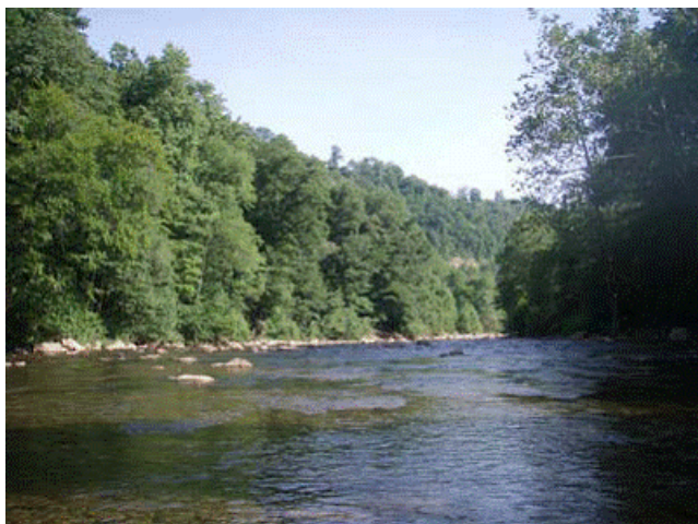
North Branch downstream from Kitzmiller

All through the EBook you will find pictures. There are one-hundred-forty of them in the EBook. The description of the second picture is taken directly from the EBook. That gives you an idea of the kind of information you will get.